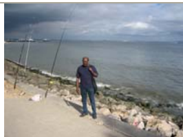
The Graceful River Tagus: Pride of Lisbon