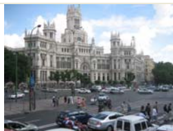
The remarkable post office Palace