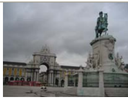
Lisbon's Amazing Architecture