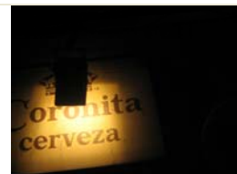
Madrid view from the tourist's bus