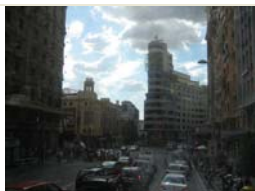
Central Madrid at dawn

My next destination was Spain's Madrid and I left Lisbon for Madrid by train on 13/07/08, in the evening. My journey took the whole night. The train seemed to be in hurry to reach Madrid and crossed several cities and towns in Portugal and Spain. I was so eager to see my next destination (Spain). Early in the morning I moved the curtain in the train and started to look outside at the lovely rural green landscape, mountains, grazing animals and rivers. When the sun rose it was marvelous and felt something unusual. I asked the people in the train, if the sunrise in Spain is different from other countries. Yes, they confirmed that. It was a bright, lovely morning. Sun+! The fast train galloped across the beautiful land of Europe it looks as if the speed accelerated because of the sun's light. I have many Spanish acquaintances and hence Madrid was another exciting city for me. During my stay in Madrid I used tourist busses and walked longer distances in this marvelous city. I enjoyed the weather, amazed by the size, beauty and its friendly people.