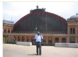
Madrid: Train Station