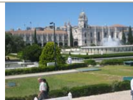
One of the Museums in Lisbon