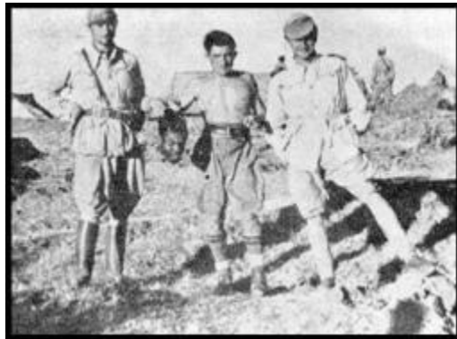
Italian Fascists posing after beheading an Ethiopian patriot