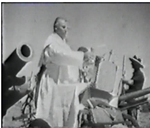
A Vatican clergy blessing the Fascist army